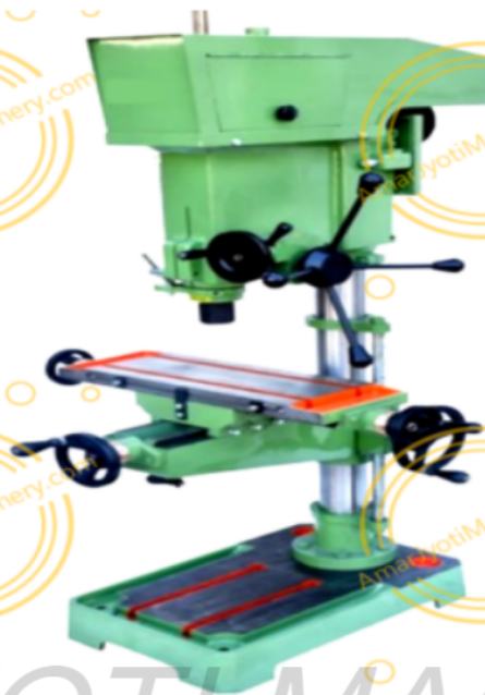
DRILL CUM MILLING