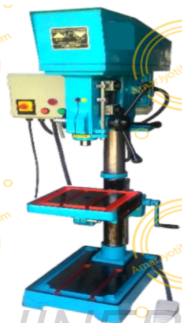
DRILL CUM TAPPING