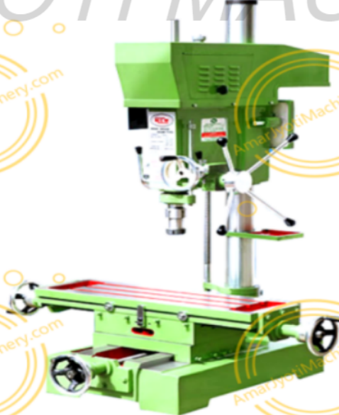
DRILL CUM MILLING